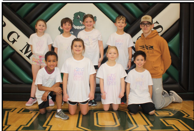
Gr. 2: Mighty Wolves