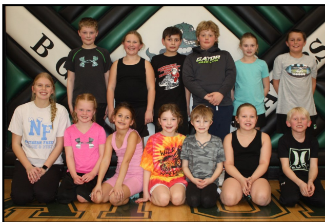
Gr. 3: Bacon Bits