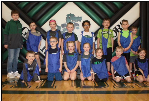
Gr. 1: Little Gators