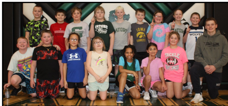
Gr. 4: Gold Rush