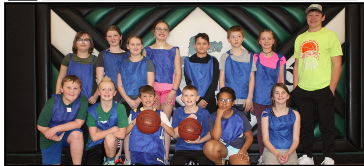
Gr. 5: Wolves